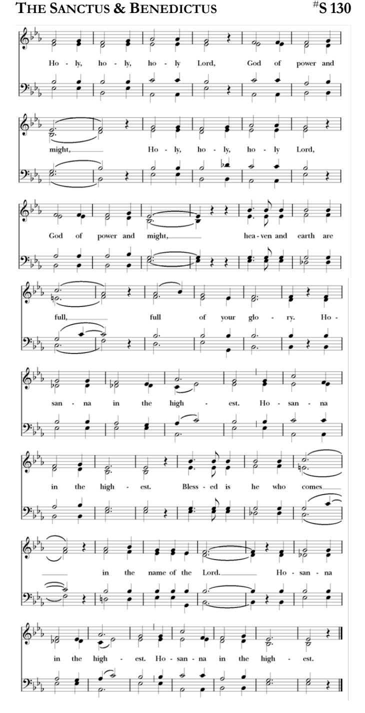
The People may stand or kneel. The Celebrant continues

We give thanks to you, O God, for the goodness and love which you have made known to us in creation; in the calling of Israel to be your people; in your Word spoken through the prophets; and above all in the